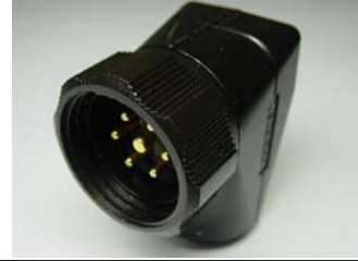
Right Angle : SLDFMC37Y