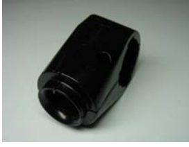
Right angle : 47383N