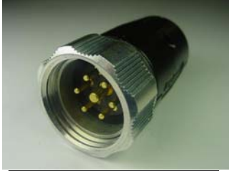
Straight : SLFMD37Y