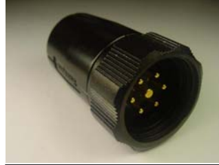
Straight : SLDFMD37Y