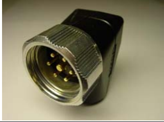
Right Angle : SLFMC37Y