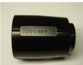
Straight : 47379N